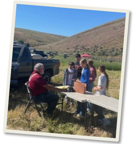
5 th grade students learned about Soils, Wildlife, Water Quality, Riparian Areas and Orienteering!